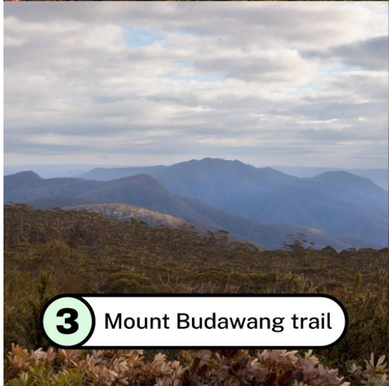
3 Mount Budawang trail