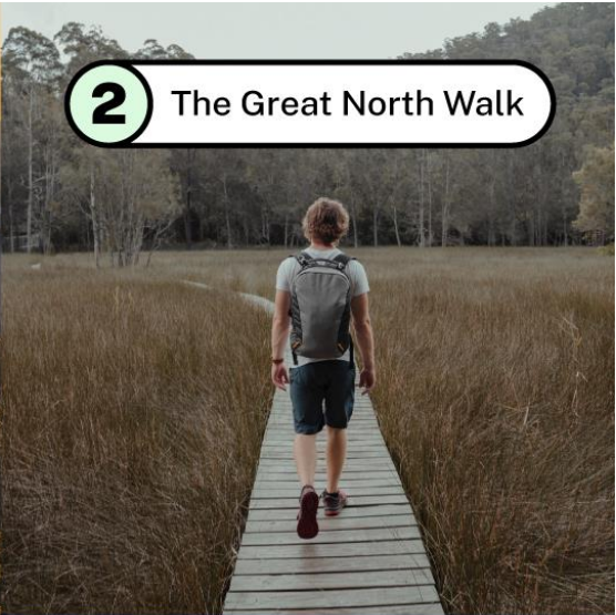
2 The Great North Walk