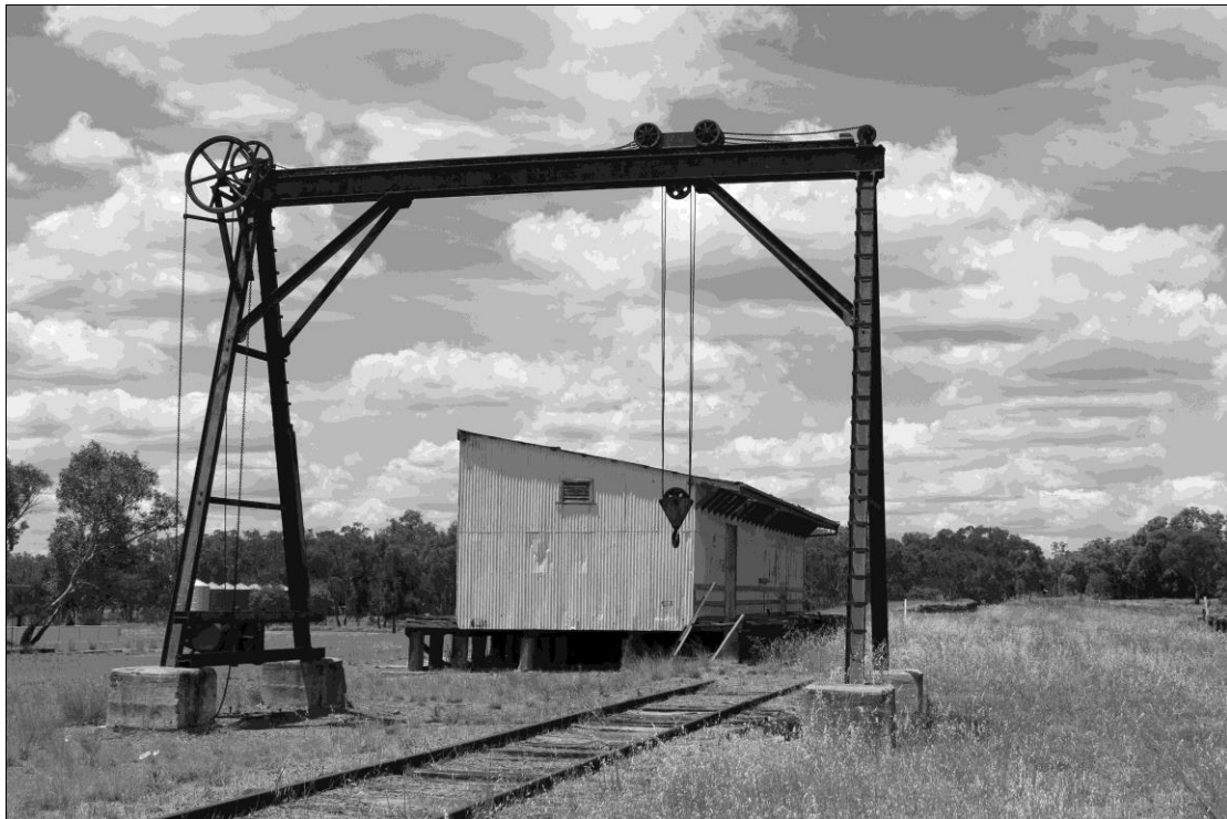
Coonabarabran Railway Station Group