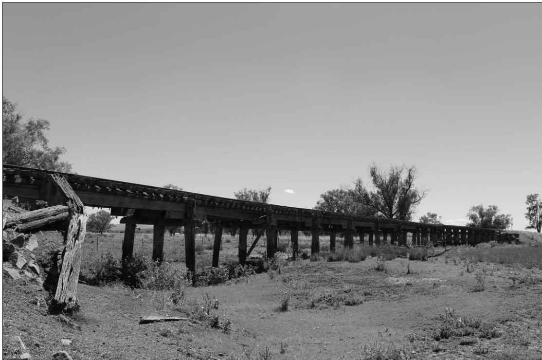
Talbragar River Railway Bridge