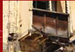
Falling down outhouses