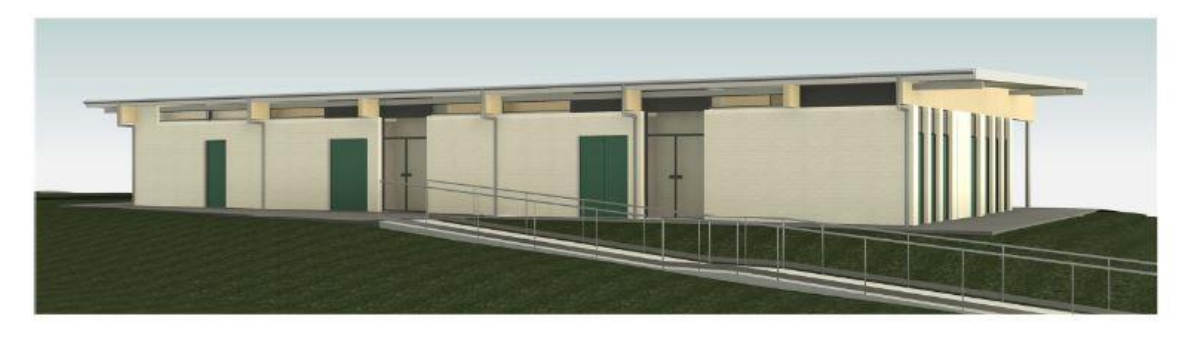
Image: Proposed design for the clubhouse and amenities building at Robertson Oval Dunedoo, from design consultants Barnson.