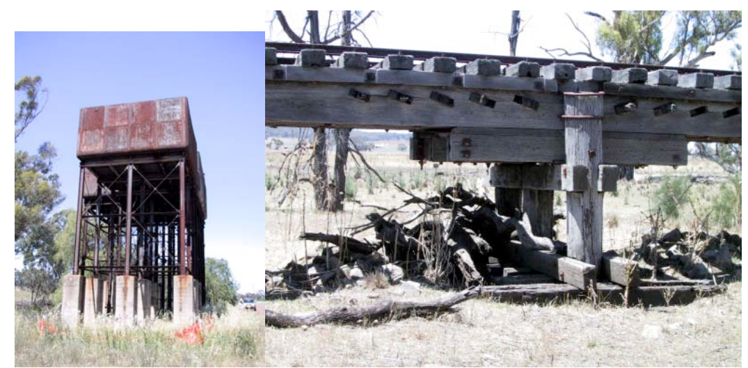
Water supply tank at Merrygoen and some great timber detailing of the railway bridge over the Talbragar River.

A very interesting railway facility of the past once serving an entirely rural community. For example siding was extensively used for the delivery of super phosphate in the 1950's and the en-railing of sheep and cattle. The unattended siding was also used far the receipt and dispatched goods, and the loading of locally grown bagged wheat. It was also proposed in 1917 for a Soldier Settlement Area which was generally unsuccessful.