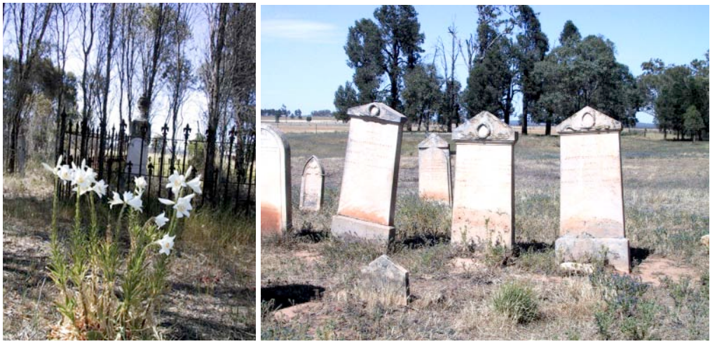
Cobbora Cemetery flowers, and great stonemasonry craft work at Merrygoen cemetery