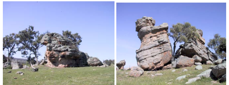
Gotta Rock and Ivy Rock: Two examples illustrating the theme of 'naturally evolved environment' that is significant as a cultural landscape

At the town or village workshops the thematic 'gaps' were highlighted to encourage people to think of examples of places that formed the important links in the various story lines. This led to community involvement as themes such as 'natural environment' or 'religion' was introduced.