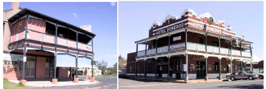
Royal Hotel at Mendooran, with mural on wall LHS and the very striking Dunedoo Hotel