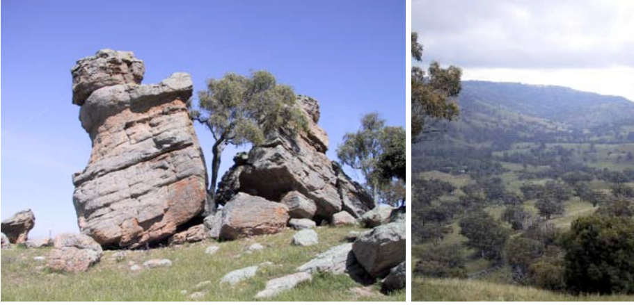
Ivy rock' and view from road to Coolah Tops 4.02.5 Engineering and Industrial Heritage

The Coolah Tops National Park with its collection of built heritage: huts, and former mill sites from the forestry days, its beautiful natural scenery, such as the Norfolk falls, and the flora and fauna, especially the silver top Eucalyptus in all produces a world class natural area for visitors to enjoy.