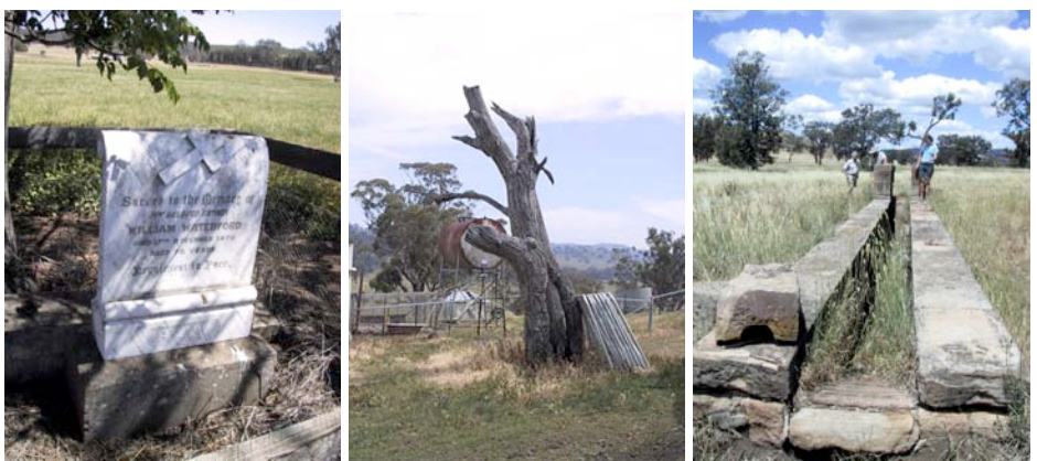
William Waterford's grave marker, The whipping tree at Rotherwood and the sandstone sheep dip of Gundare are all reminders of a convict past.