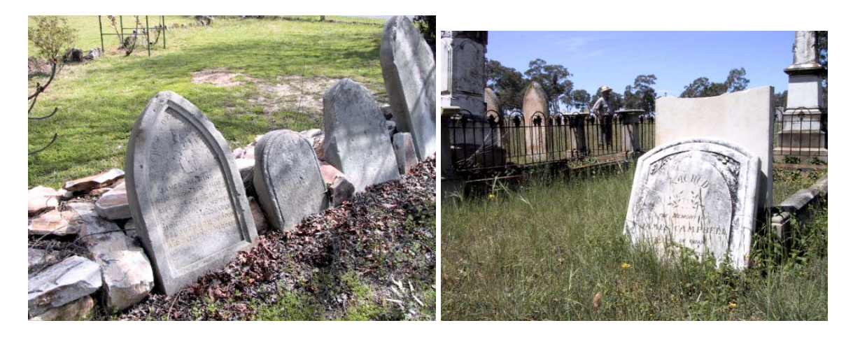
Headstones at the Presbyterian Church cemetery in Coolah, and at Uarbry Cemetery.

Cemeteries that should be included on such a map are Coolah Presbyterian Church, Cobbora General Cemetery, Denison Town General cemetery, Lahey's Creek Private, Leadville cemetery, Mendooran General Cemetery, Turee (Vale) Creek General and Uarbry. Each of these has a special role to play in the history of the district and each has its own special appeal as a place of remembrance and peace.