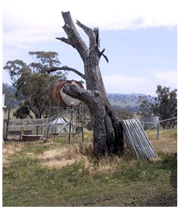
The convict whipping tree at Rotherwood. Image BJH Examples are as follows: