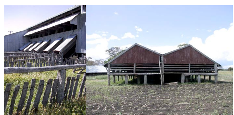
Shearing sheds at Moreton bay and Binnia Downs illustrating the theme of pastoral stations and working life