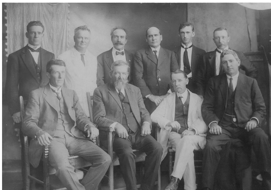
Coonabarabran Shire Council - Councillors 1918