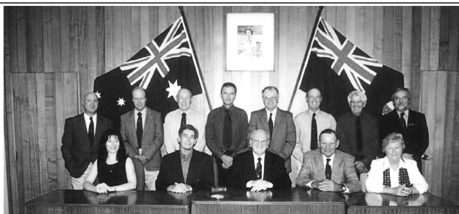
Coolah Shire Council Councillors 1999 – 2003