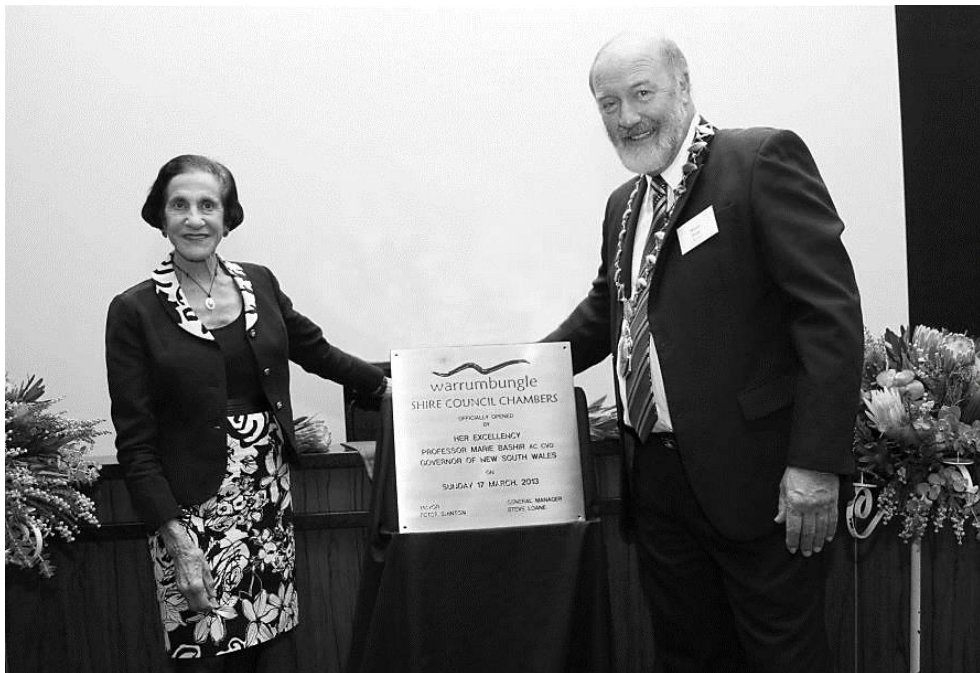
First Mayor of Warrumbungle Shire Council Opening of the new Council Building in Coonabarabran 2013