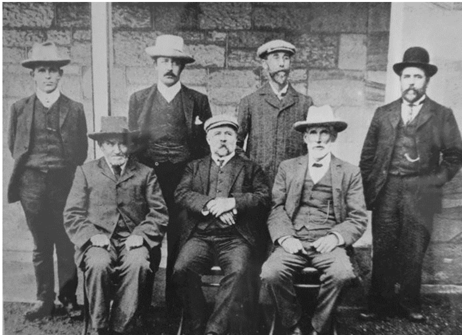
Coonabarabran Shire Representatives 1907