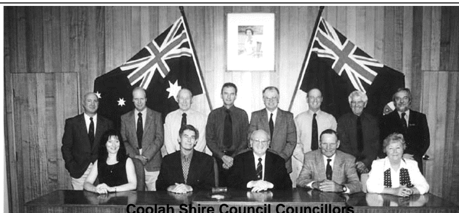
Coolah Shire Council Councillors 1999 – 2003