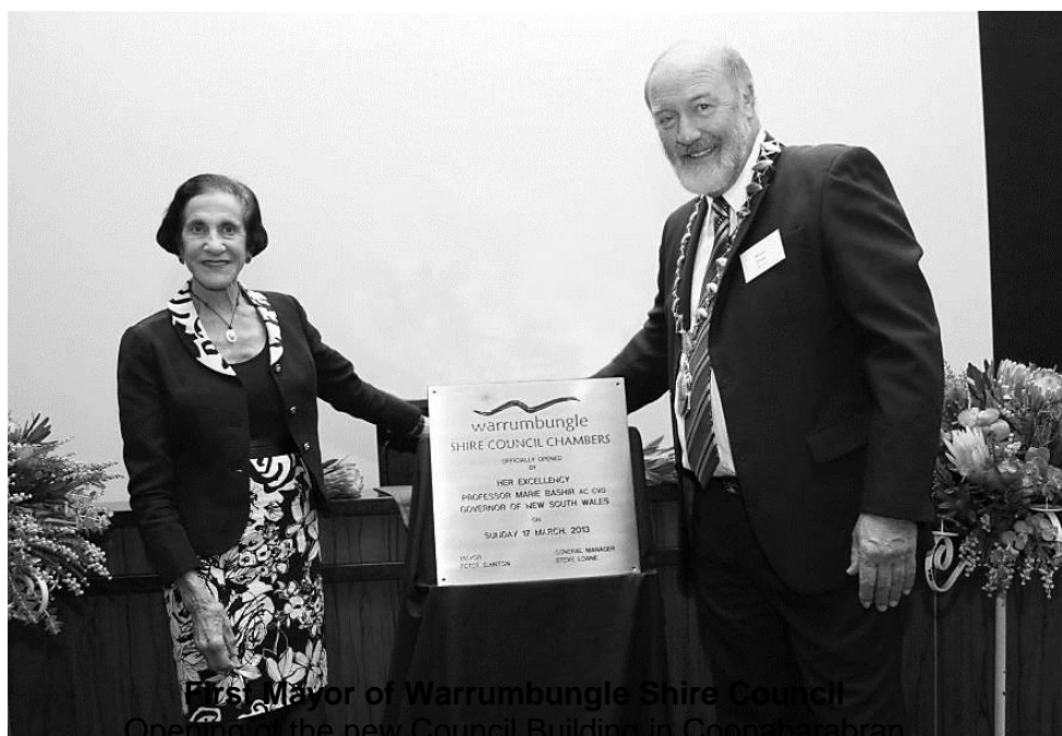
His Mayor of Warrumbungle Shire Council Opening of the new Council Building in Coopers Plains