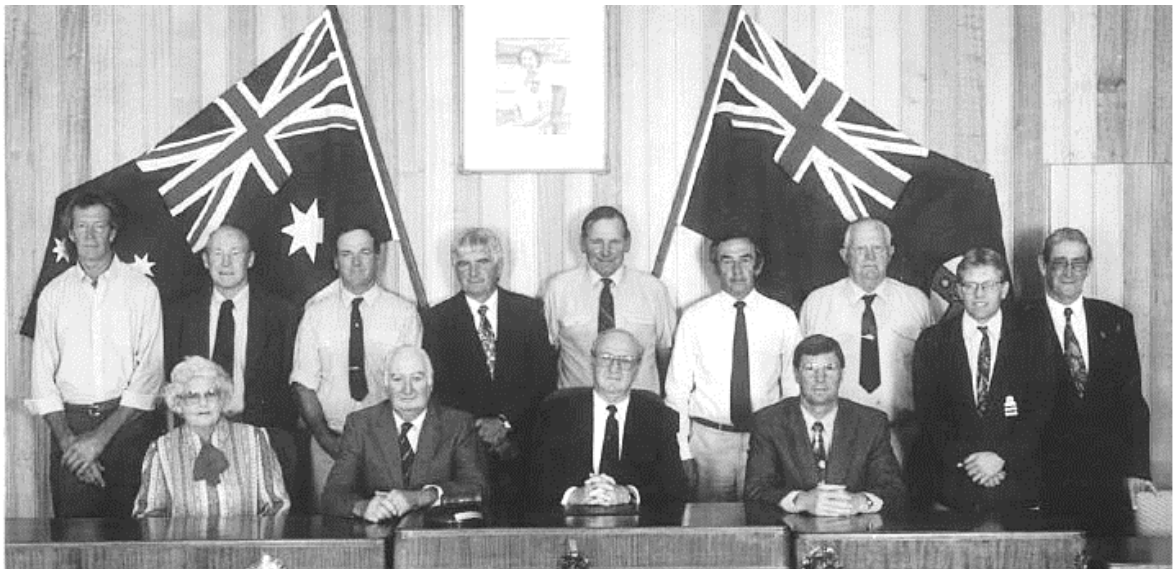
Coolah Shire Council Councillors 1991 – 1995